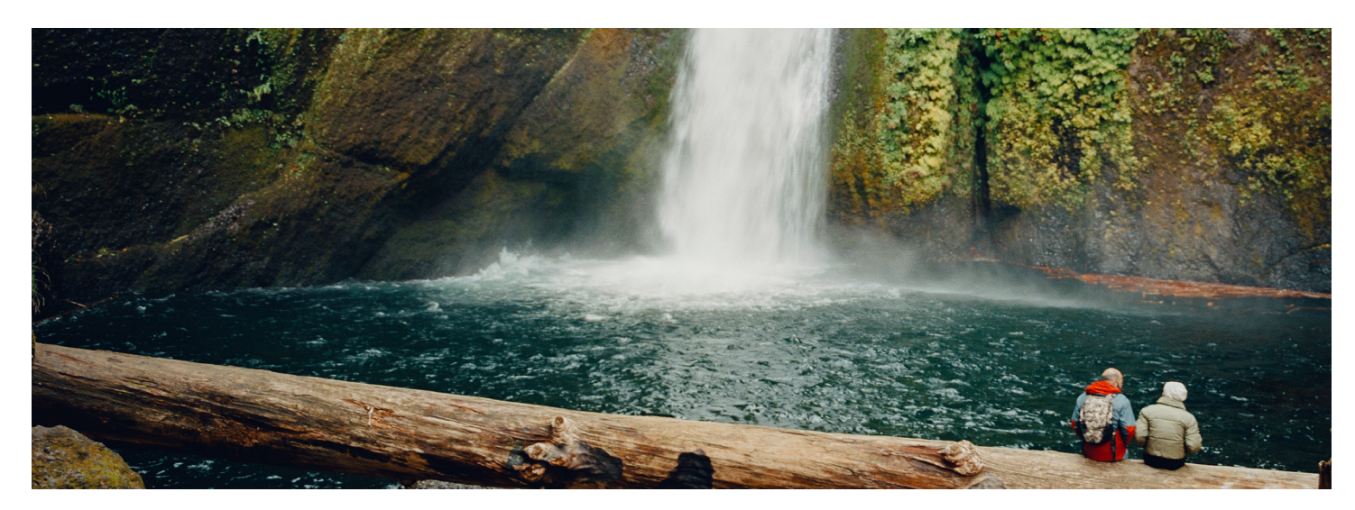
*The Participation Rates for the Momentum Index One-year point-to-point and Two-year point-to-point crediting strategies are guaranteed for 10 years from the annuity issue date, provided that Sentinel Security Life Insurance Company continues to have access to the Momentum Index. The Participation Rates for the Diversified Macro 5 Index One-year point-to-point and Two-year point-to-point crediting strategies are guaranteed for 10 years from the annuity issue date, provided that Sentinel Security Life Insurance Company continues to have access to the Diversified Macro 5 Index.

A Fixed Indexed Annuity offers access to more interest growth potential as the market performs positively. In addition to growth potential, a Fixed Indexed Annuity offers protection of principal in several different ways. You do not lose money, including interest earned during previous crediting periods, if the index value drops because your money is allocated to the annuity itself rather than directly to the index (or indices). Additionally, the indexed accounts typically offer a minimum guaranteed interest rate of at least 0%.