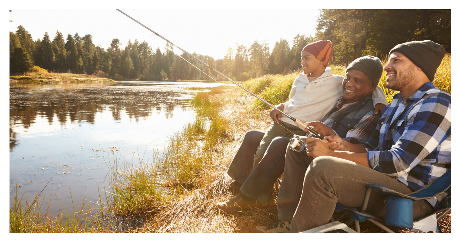
*If Rate Enhancement Rider is purchased, principal will not decrease due to market performance but could decrease due to the rider fee.

Achieve greater financial confidence and achieve the goals you have set for your lifestyle, retirement income and legacy by taking advantage of the flexible options provided by the Accumulation Protector Plus<sup>SM</sup> Annuity. These strategies were created to help protect what you have worked hard for and provide opportunities to accumulate wealth, so you can rest easy in retirement knowing you are preserving the legacy you have built.