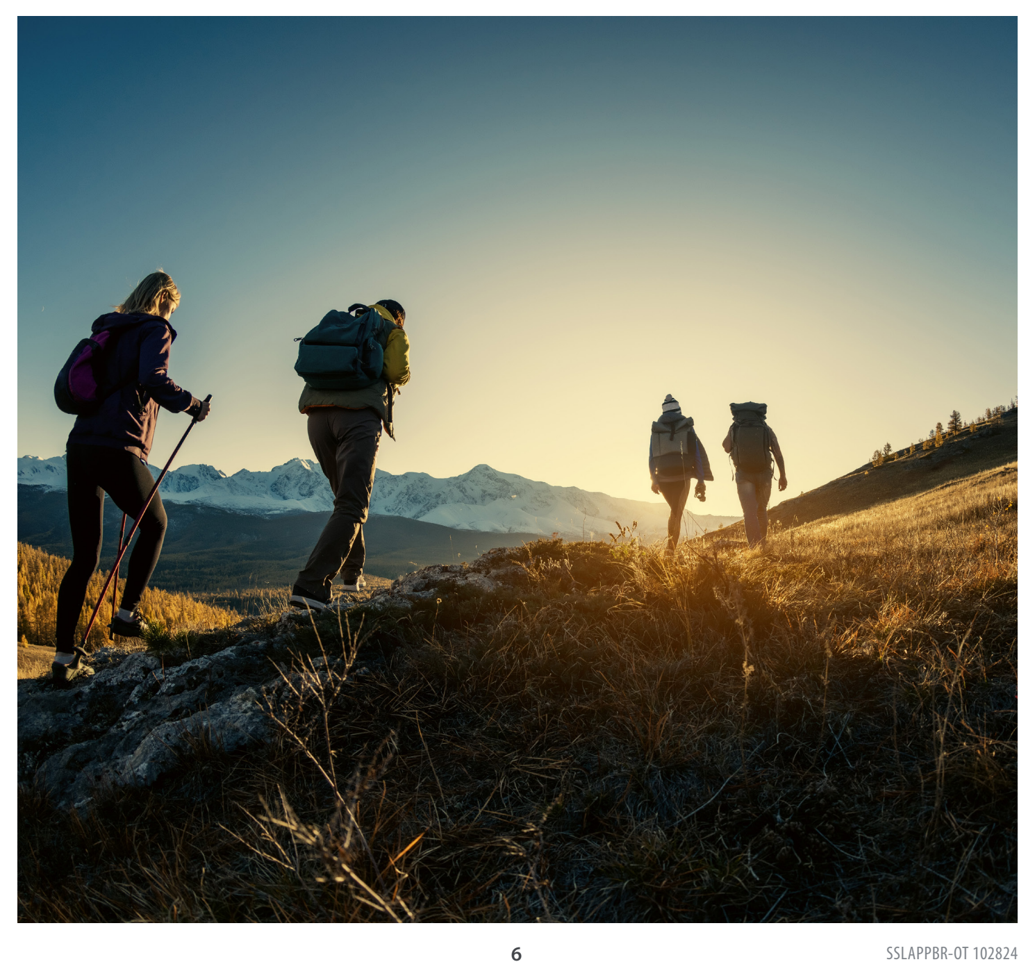
To learn more about this index, please read the Diversified Macro 5 Index brochure.

Access to the Diversified Macro 5 Index is exclusive to buyers of the Accumulation Protector Plus<sup>SM</sup> Annuity.